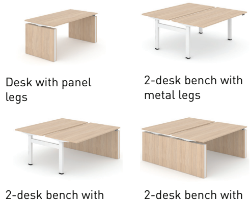
2-desk bench with panel legs

Desk height: 700-1200 mm (2), 650 -1300 mm (3)