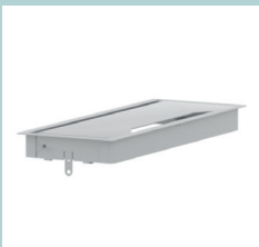
Metal grommet: 317x119 mm, H=27 mm