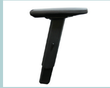
Height adjustable armrests