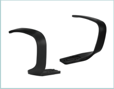
Fixed plastic armrests